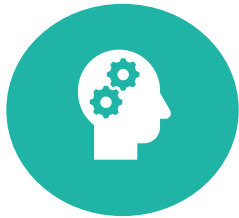
Strategic Solutions (SS)