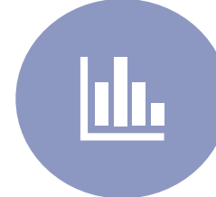
Portfolio Analysis (PA)