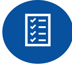
Project Operations Compliance (POC)