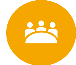
Program Administration and Physical Inspection (PAPI)

The Executive team establishes departmental strategic direction. The Strategic Solutions team serves as an implementation driver through consultative services to the core business unit teams of Project Operations Compliance , Portfolio Analysis , and Program Administration and Physical Inspection who focus on operational, financial, programmatic, and physical compliance, respectively. This work is pursued in accordance with three core values - Communication , Accountability , and Consistency .